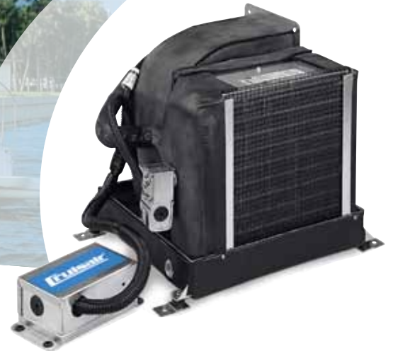
EHMB12C cooling/ heating unit

Cruisair modulating DX evaporators are ductable cooling only (EMB) or cooling with electric heating (EHMB) units with built-in refrigerant solenoid valves and high-efficiency blowers. Cruisair modulating air conditioning systems allow up to five independent temperature-controlled zones on one RM type modulating condensing unit (see spec sheet L-2366).